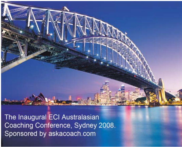
The Inaugural ECI Australasian Coaching Conference, Sydney 2008. Sponsored by askacoach.com